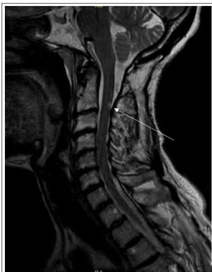
Figure 1: MRI of the Cervical Spine Without Contrast Showing a Small Focus of Increased T2/STIR Signal Intensity in the Dorsal Midline at the Level of C2-3, Sagittal