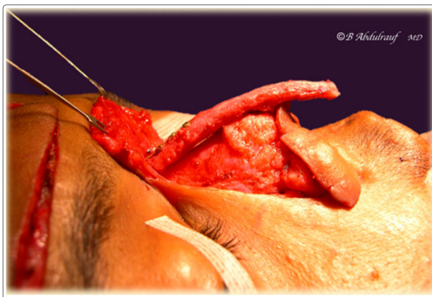
Figure 8: Cantilever graft held to radix with mini-plate and screws. Most of external nasal skin has been discarded.