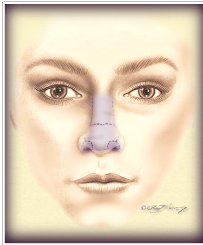
Figure 2: Author’s illustration of nasal aesthetic subunits based on Burget G. and Menick F. principle, 1985

The principle of aesthetic “Nasal Subunit” reconstruction by Burget and Menick is well respected and considered to be the excellence of care in nasal reconstruction [4]. They have recognized nine “Subunits” defined also by gentle valleys and low ridges that become apparent with light and shadows. Three are unpaired: Dorsum, Tip and Columella. Other three are paired: Side walls, Alar-nostril sill and the Soft triangles (Figure 2).