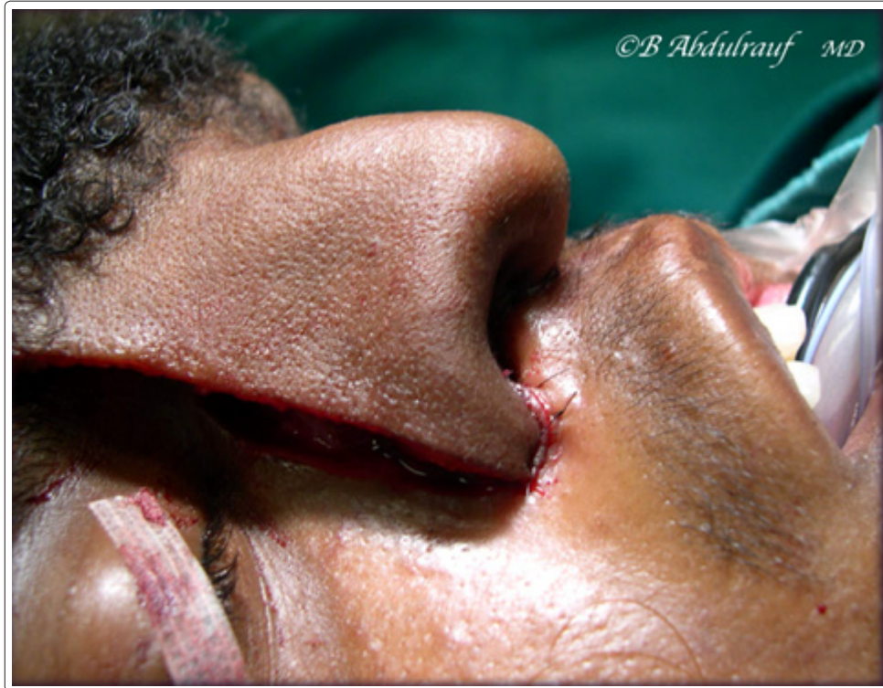
Figure 9: Nasal coverage with Scalping flap. Profile view