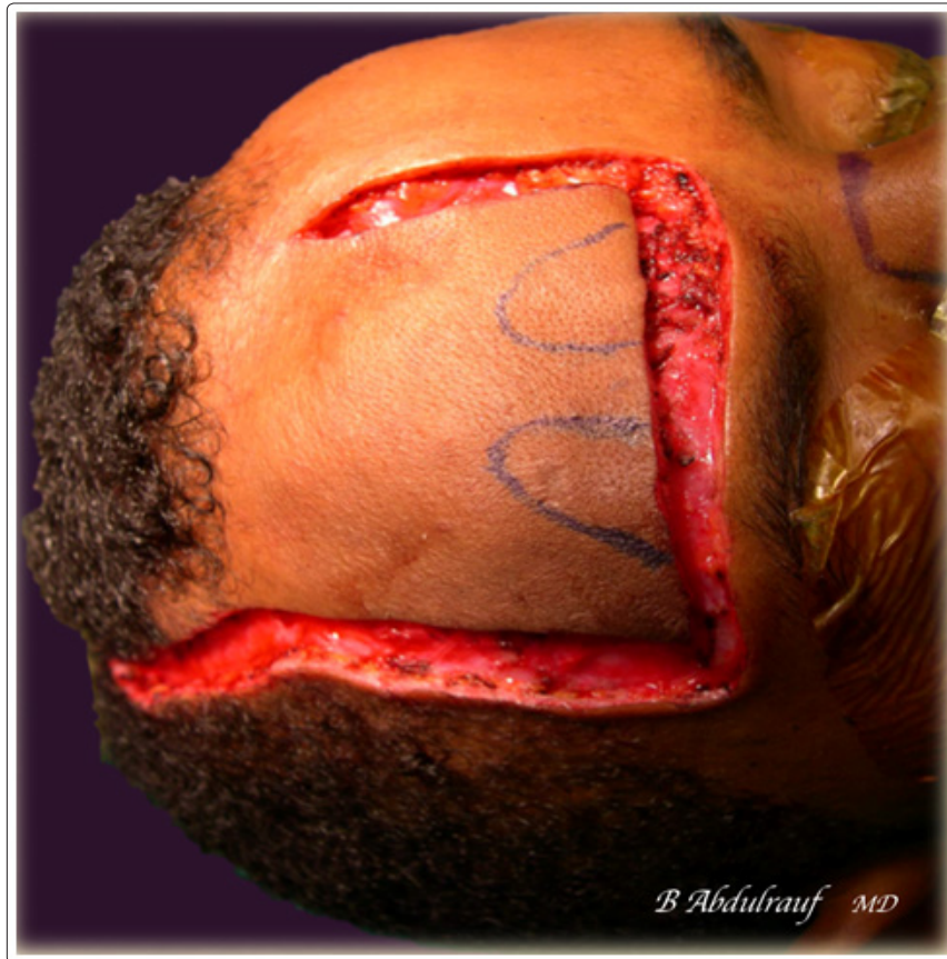
Figure 7: The patient in figure 6 at time of reconstruction. Approximately 7 cm width of unilateral forehead is used in order to accommodate the future nose.