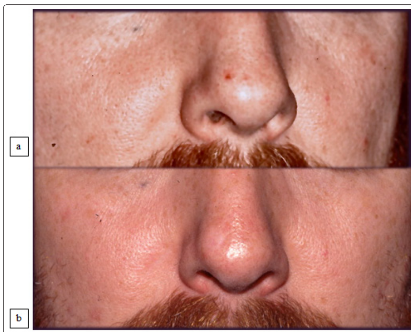
Figure 5: Type 1 skin adult with superficial BCC to nasal tip subunit (a: above) Post FTSG following localized excision without utilizing Subunit principle, with barely noticeable scar, apart from slight graft hypopigmentation (b: below)

The outcome shown in the above patients is however not by any means one would expect and or accept to see in an average Caucasian type I or type II skin, if they had same scenario. On the other extreme and in comparison to the above cases, a patient is shown in (Figure 5) with BCC on the nasal tip region, which is an area that many would advocate for a flap due to the thick oily nature of skin here as well it is more adherent to underlying cartilage. However, this (type I skin) patient was only treated with simple excision, a FTSG and without applying the 50% rule. The graft is barely noticeable apart from slight hypopigmentation. The obvious explanation is the fair skin type.