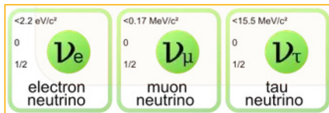
Figure 2-1: Elementary Particles of Dark invisible Matter