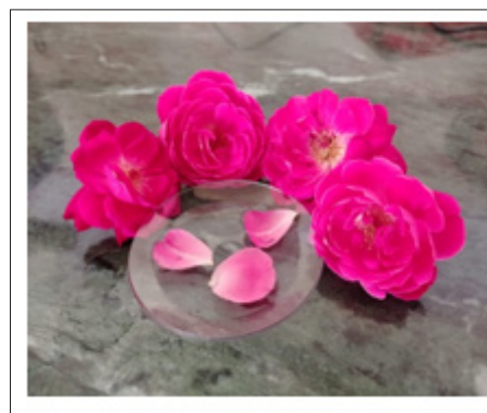
Figure 1: Rose Petal Extract

The following ingredients were used for the preparation of the herbal hair serum formulation.