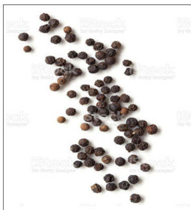
Figure 3: Black paper