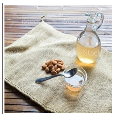
Figure 4: Almond oil