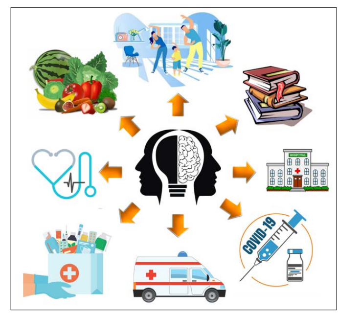
Figure 1: Graphical Abstract Health Literacy

operates; ability to communicate with health care providers; ability to locate health information, which may be associated with age, income, education, language skills, and culture; and physical or psychological limitations. Health literacy affects treatment adherence, which may have an impact on treatment outcomes. Despite the negative implications of LHL, physicians are typically unaware of their patients' health literacy levels and their subsequent effects on their patients' outcomes.