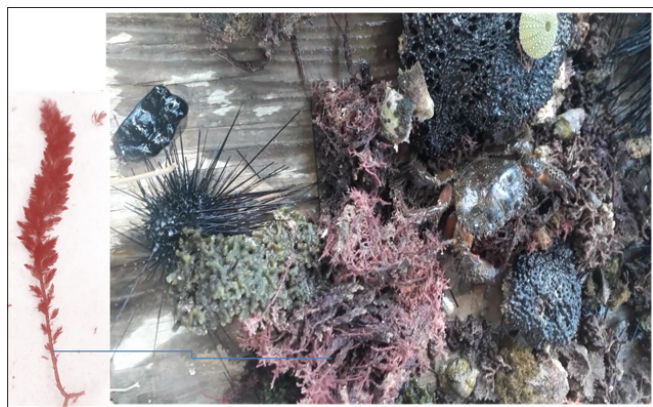
Figure 3a: Sea urchin and its associated benthic species in Fanar Ibn Hani MPA.