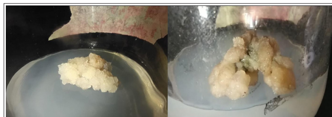
Figure 2: Light White to Yellowish Friable Callus Produced in Vitro Cultured Leaf Explants of Catharanthus Roseus at Ms Medium With Ba 0.3 Mg/L And 2,4-D 0.75 Mg/L Hormonal Combination.