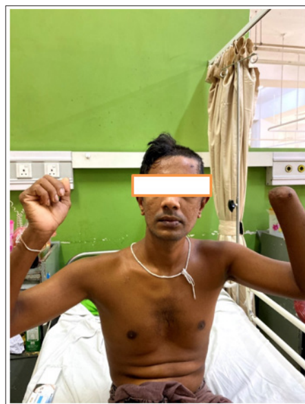
Figure 3: Patient before Discharge

Following day patient underwent the left sided decompression and temporal lobectomy. Patient was admitted to the ICU for post operative care. Repeat CT was satisfactory and there were no features of raised ICP. patient was weaned off from the ventilator after 48 hours. Patient was extubated after 72 hours of the surgery and was having satisfactory recovery with a GCS of 14. He was having right sided weakness after the extubation. After 20 days of hospital stay patient's motor function recovered completely and was discharged from hospital.