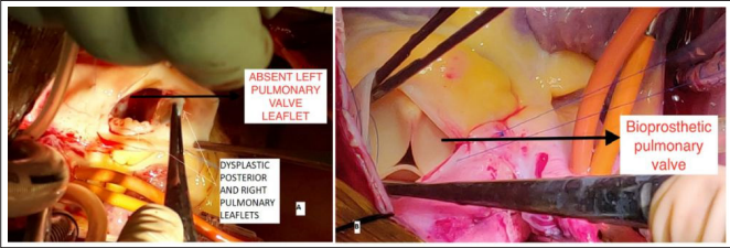
Figure 2: A- Surgical image of Pulmonary Valve – White arrows showing the dysplastic posterior and right pulmonary leaflets. Black arrow showing the absent left leaflet. Figure 2: B - Number 23 stented bioprosthetic valve (LivaNovaCE Crown PRT) in position in the pulmonary artery.

Among the causes for congenital IPVR, idiopathic dilatation of MPA is most common (0.6% of CHD) and bicuspid PVs are considered to be the rarest (0.2% of CHD) [1]. Bicuspid PV refers to an anatomy similar to bicuspid aortic valves, wherein the valve is bi-commissural. In a semilunar valve with absent single cusp, there are 2 dysplastic or normal cusps attached at a single commissure and the third cusp is absent. There are only 3 reported cases with absent single cusp causing severe PR (Table 1) [2,3]. Ours is the fourth.